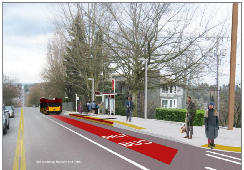
Bus station at Madison and John

Rendering at Madison and E John St shows a station platform level with the bus, bus only lane, new curb ramp, yellow tactile strip for people with vision impairments, station shelter, and real time arrival information.