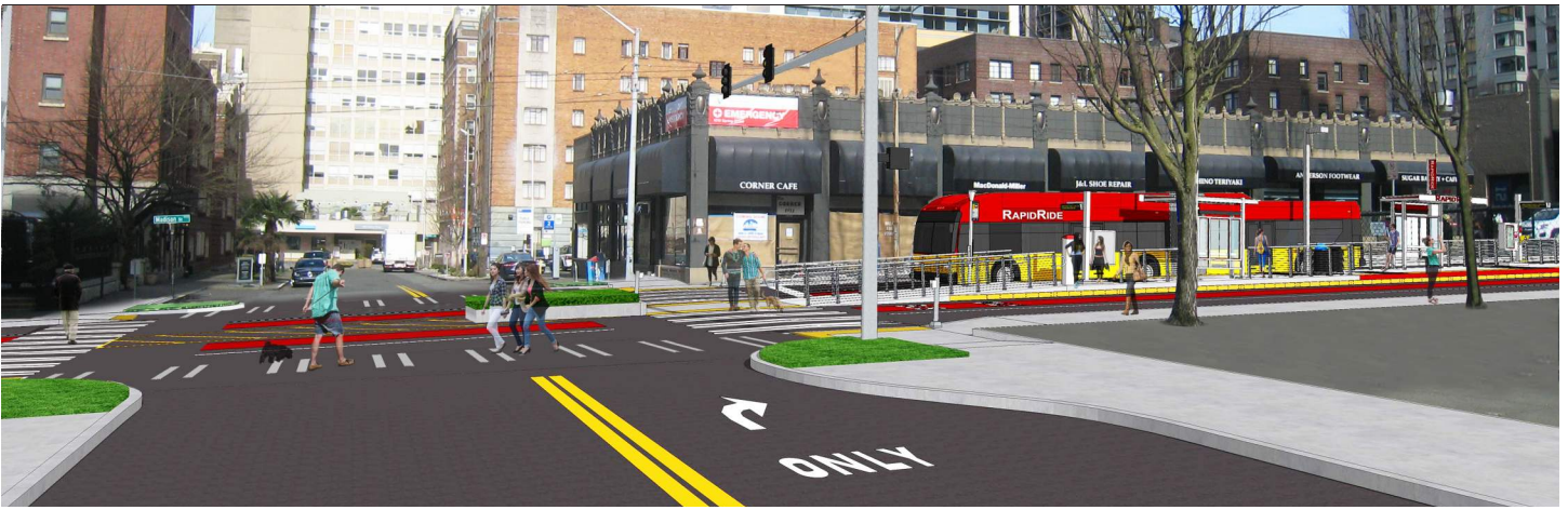
Madison St and Terry Ave