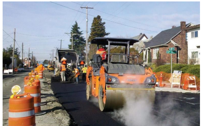
Example of crews paving the street