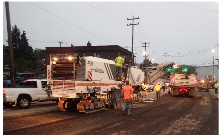
Example of crews grinding the street