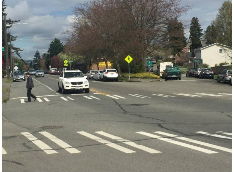
Wilson Ave S needs to be repaved