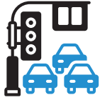
Gaadiidka & Saxmada

Dadka buuxinaya codaynta saadaasha socodka gaadiidka xaafada waxay noo sheegeen inay walaac ka qabaan: