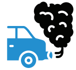
Saamaynta Deegaanka & Wasakhda

Xaafad kastaa waxay leedahay caqabad gaar ah iyo mushkilado. Dhamaan xaafadaha waxay u baahan yihiin dejinta isku socodka gaadiidka oo dheeraad ah, mashaariic iyo ikhtiraac. Bulsho kastaa waxay leedahay fikiro dheeraad ah iyo xal ay kaga jawaabayso saamaynta jidka la marayo ee leexanaya.