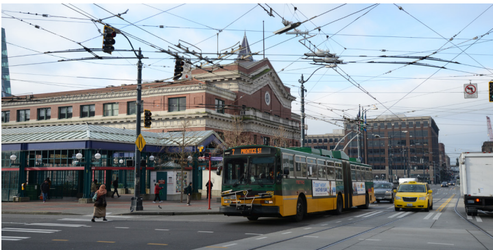
A current view of Union Station and the location of Bridge 33W in Seattle.

As the City shapes its future for the Jackson Hub area, this project will consider replacement and/or rehabilitation options for the study structures that support that future vision. We will consider the various modes of travelling through the area, future environmental and transit goals, agency requirements, neighborhood impacts, and community feedback throughout the study process.