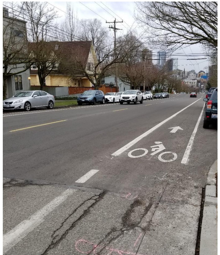
Existing bicycle lane on Union St looking west near 17th Ave

PROJECT INFORMATION & CONTACT www.seattle.gov/transportation/e-union-st Chris Svolopoulos, UnionPBL@seattle.gov or 206-684-5312