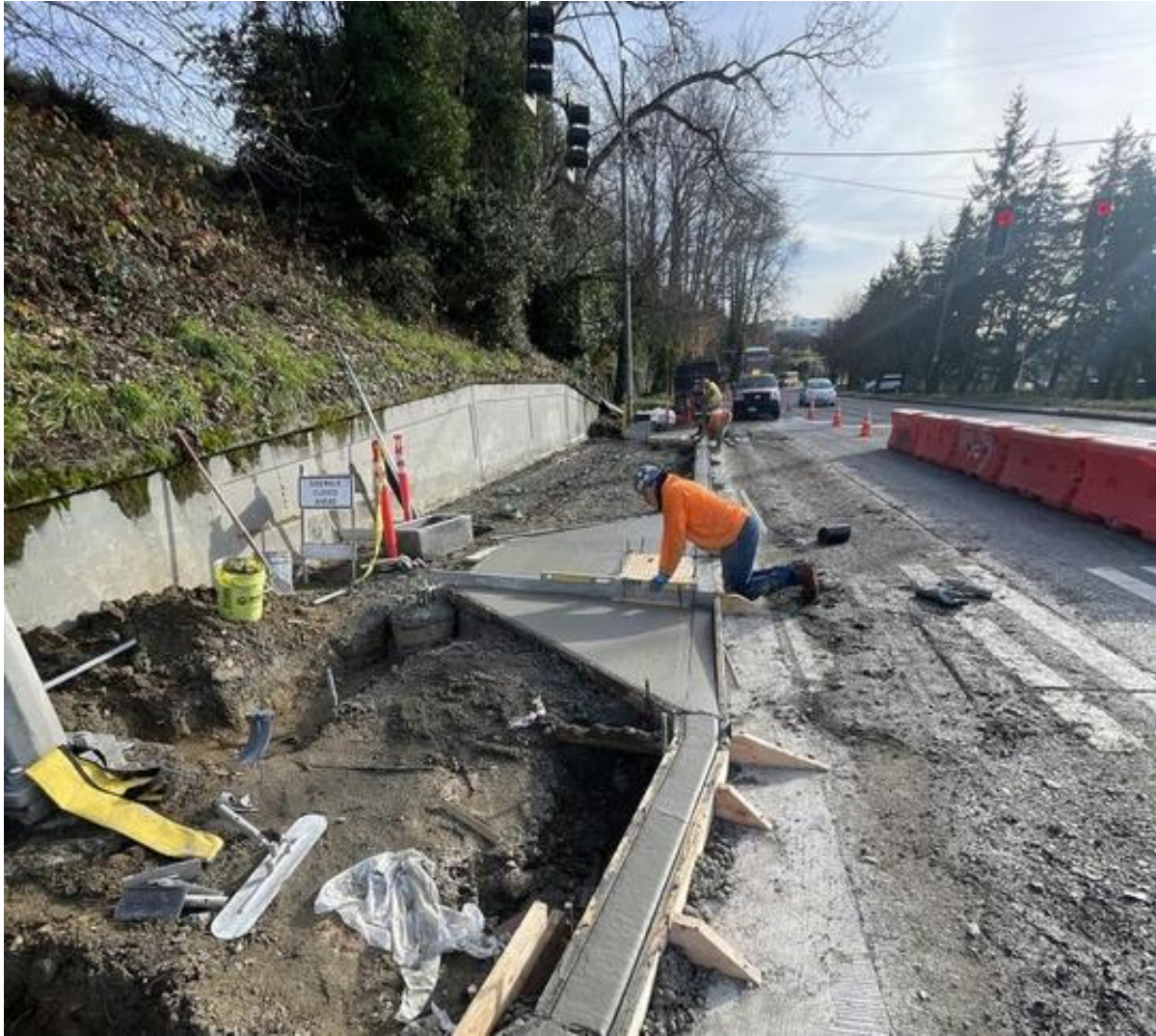
Crews installing curbs and curb ramps on the east side of MLK Jr Way S and S Bayview St as part of the MLK Jr Way Safety Project.